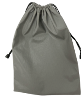
Carry bag (x1)