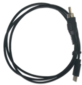
Video output cable (x1)