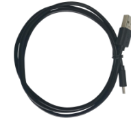
USB cable (x1)