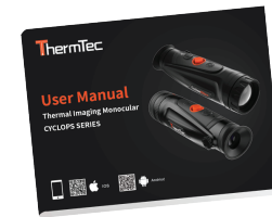
User manual (x1)