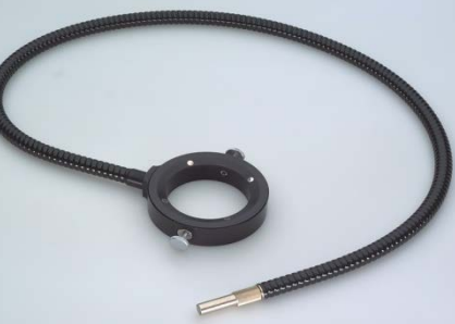
4-point ringlight 66 mm