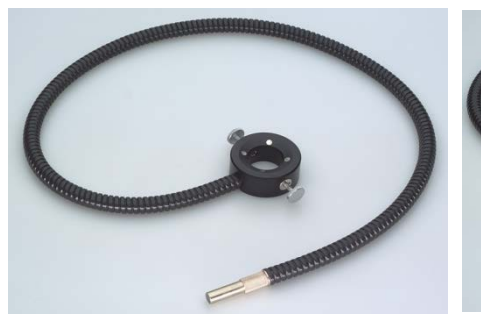
4-point ringlight 30 mm