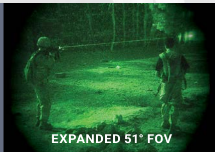
EXPANDED 51° FOV