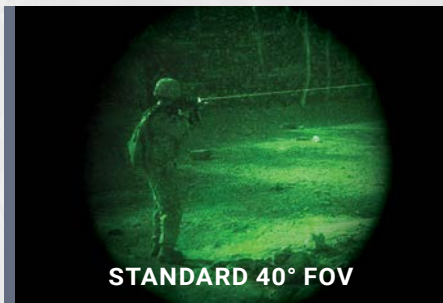
STANDARD 40° FOV