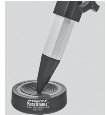
Figure 2b. Make certain the tripod leg rests in the exact center of the pad.