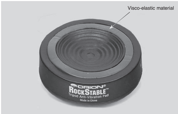
Figure 1. The RockStable anti-vibration pad

Orion RockStable tripod anti-vibration pads add stability to your telescope's mount to enhance your observing activity. Your mount can receive unwanted vibrations from such commonplace events as a gust of wind, a foot stomping too closely to the tripod leg, a hand inadvertently hitting the optical tube, even focusing! These vibrations take time to subside and can make the object you're observing "jiggle" in the scope's field of view, or totally ruin an astrophotograph.