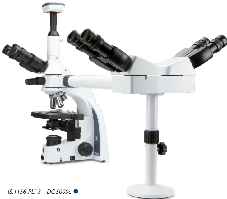
IS.1156-PLi-3 + DC.5000c ●