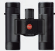
LEICA ULTRAVID 8 x 20 BR Page 35