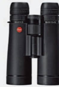
LEICA DUOVID 10 + 15 x 50 Page 49