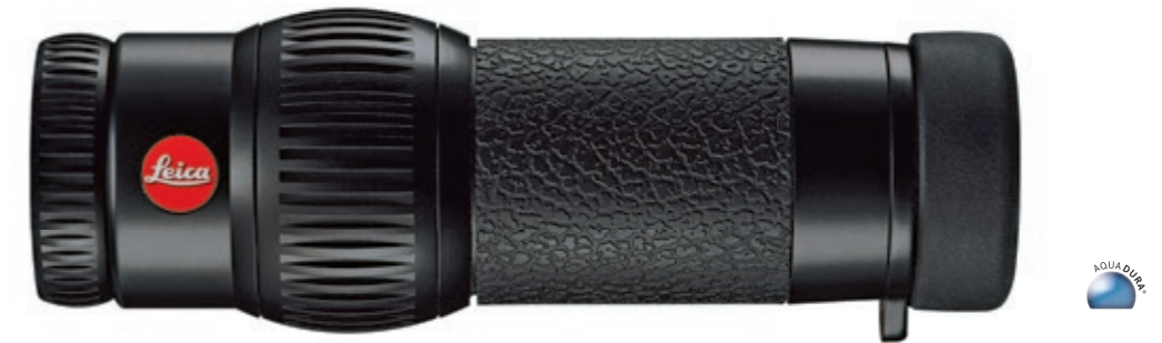
LEICA MONOVID 8x20 BLACKLINE

Superb quality, 8x magnification and elegant design make the Monovid a truly impressive instrument.