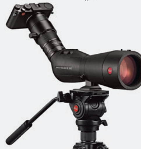
LEICA DIGISCOPING KIT Page 73