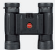
LEICA TRINOVID 8 x 20 BCA Page 45