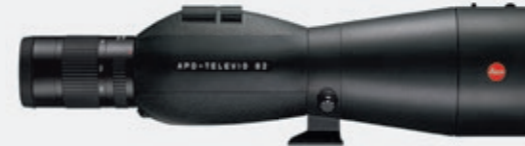
LEICA APO-TELEVID 82 with LEICA EYEPIECE 25 x - 50 x WW ASPH. Page 61