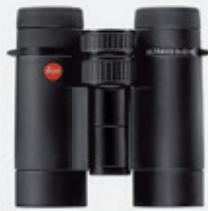
LEICA ULTRAVID 8 x 32 HD Page 19