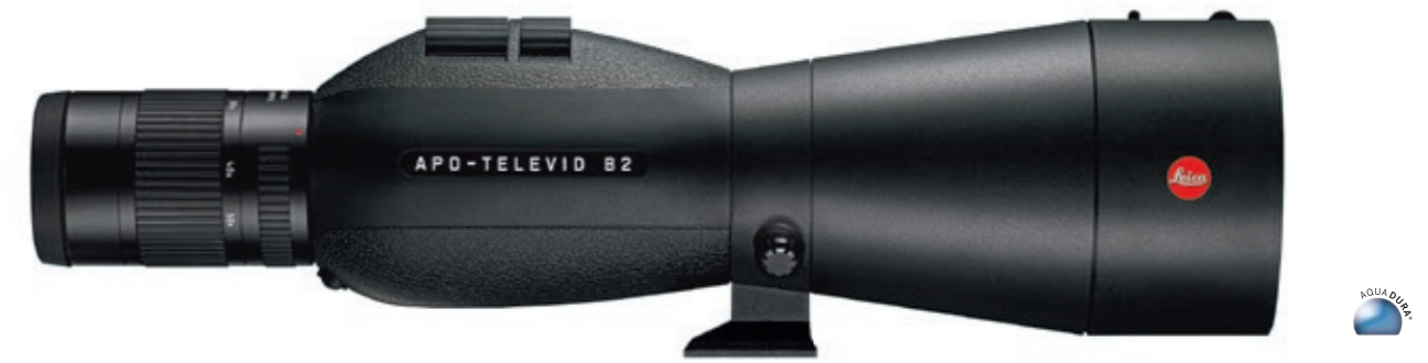
LEICA APO-TELEVID 82

The apochromatic optical system of the APO-Televid 82 includes modern fluoride glass to ensure perfect optical performance. The inner optical system is additionally protected by an optically neutral covering lens. The large front-lens diameter of 82mm delivers a richly detailed view and its enormous light-gathering performance enables viewing even in the most difficult lighting conditions.