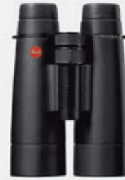
LEICA ULTRAVID 8 x 50 HD-PLUS Page 27