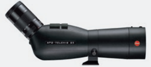
LEICA APO-TELEVID 65 W with LEICA EYEPIECE 25 x - 50 x WW ASPH. Page 59