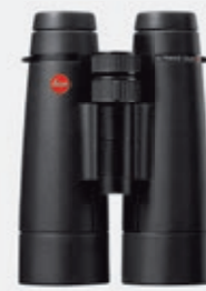
LEICA ULTRAVID 10 x 50 HD-PLUS Page 27