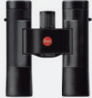
LEICA ULTRAVID 10 x 25 BR Page 37