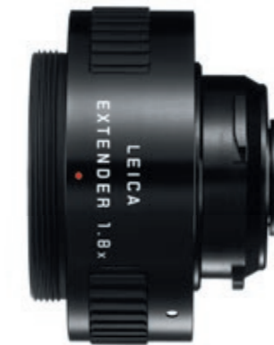
LEICA EXTENDER 1.8 x