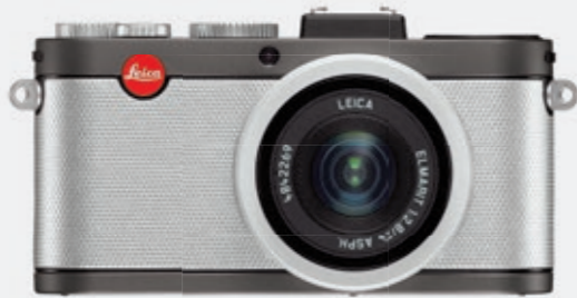
LEICA X-E (Typ 102)