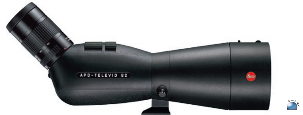
LEICA APO-TELEVID 82 W