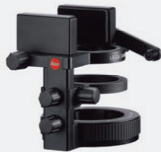
LEICA UNIVERSAL-DIGITAL-ADAPTER 3 FOR COMPACT CAMERAS