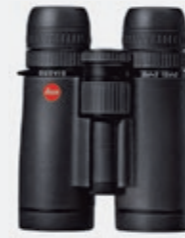
LEICA DUOVID 8 + 12 x 42 Page 49