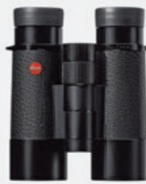
LEICA ULTRAVID 10 x 42 Blackline Page 31