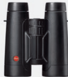
LEICA TRINOVID 10 x 42 Page 43