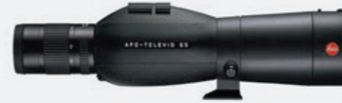
LEICA APO-TELEVID 65 with LEICA EYEPIECE 25 x - 50 x WW ASPH. Page 59