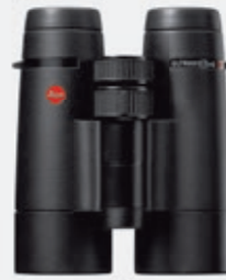
LEICA ULTRAVID 7 x 42 HD-PLUS Page 23