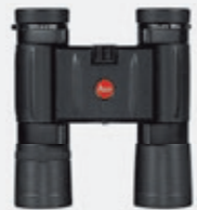
LEICA TRINOVID 10 x 25 BCA Page 45