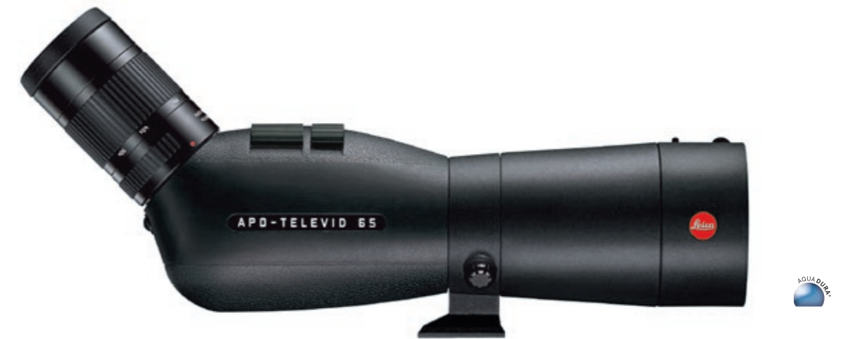
LEICA APO-TELEVID 65 W