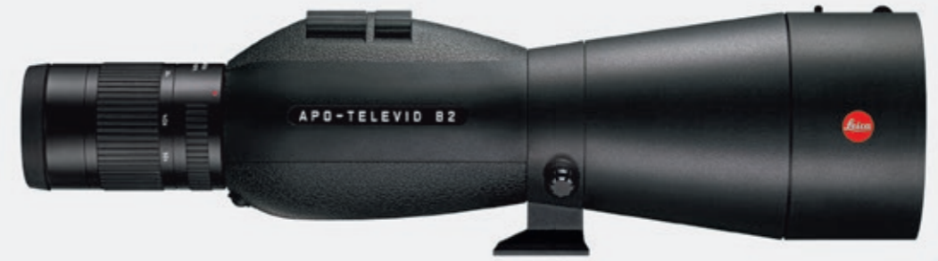
LEICA APO-TELEVID 65 and 65 W/82 and 82 W with LEICA EYEPIECE 25 x - 50 x WW ASPH.