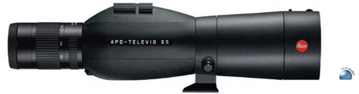
LEICA APO-TELEVID 65

You can look forward to first-class images – regardless of whether your subject is close to you or far away.