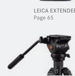
LEICA VIDEO HEAD VH2 Page 66