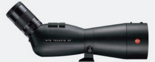
LEICA APO-TELEVID 82 W with LEICA EYEPIECE 25 x - 50 x WW ASPH. Page 61