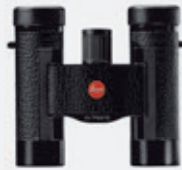
LEICA ULTRAVID 8 x 20 Blackline Page 35