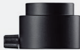
LEICA X1/X2/X-E (Typ 102) DIGISCOPING-ADAPTER