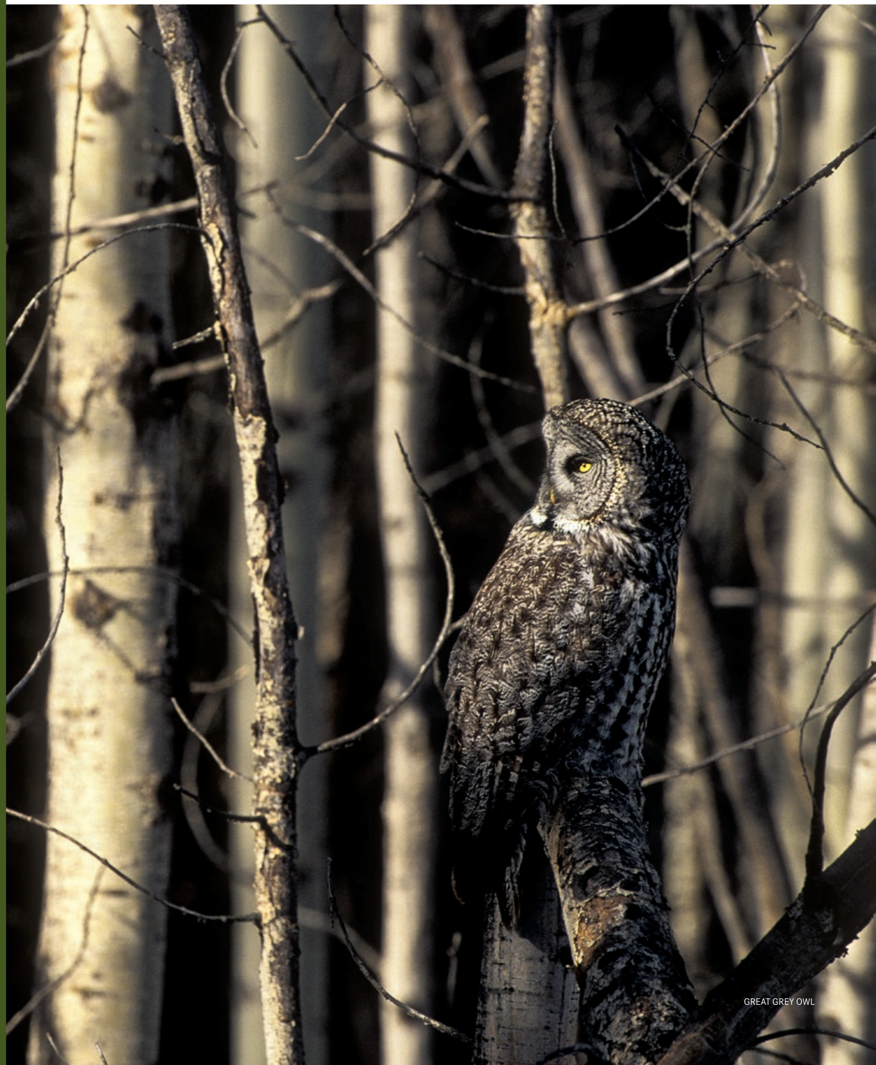
GREAT GREY OWL