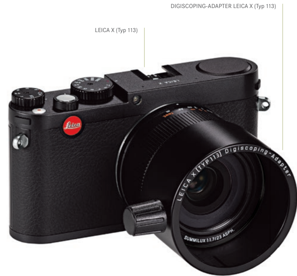
LEICA X (Typ 113)

Leica is the German premium manufacturer to provide a complete professional system from one single brand - with perfectly balanced equipment of highest quality. Just like our binoculars and spotting scopes, all Leica camera models are meticulously manufactured from only the finest materials to ensure absolute reliability and enduring value. In addition to their compact form, elegant design and intuitive handling, their optical and mechanical quality is without compromise.