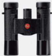
LEICA ULTRAVID 10 x 25 Blackline Page 37