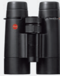
LEICA ULTRAVID 10 x 42 HD-PLUS Page 23