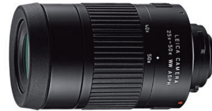
LEICA EYEPIECE 25x – 50xWW ASPH.

The bayonet system has an integrated, automatic eyepiece lock that attaches eyepieces quickly and securely to the spotting scope. The rubber-armoured functional components and practical rotating eyecup ensure excellent viewing comfort. Even when wearing gloves, the eyepiece can be precisely adjusted.