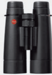
LEICA ULTRAVID 12 x 50 HD-PLUS Page 27