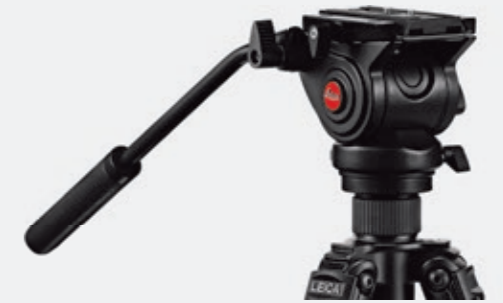
LEICA VIDEO HEAD VH 2