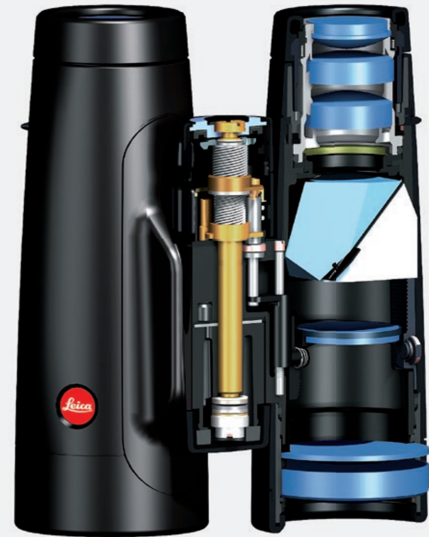
CUTAWAY VIEW LEICA TRINOVID 8 x 42

The Trinovid 8 x 20 BCA and 10 x 25 BCA are small, high-quality compact binoculars that are, in technical terms, comparable with many larger types of binoculars. These handy compacts are ideal in precisely those situations when space and weight are prime considerations, for instance on long trips or when travelling.