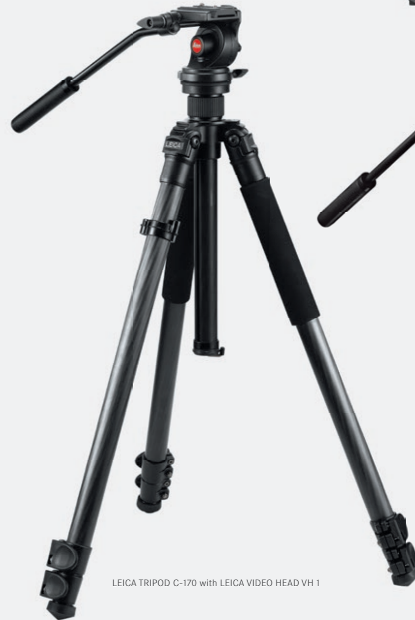
LEICA TRIPOD C-170 with LEICA VIDEO HEAD VH 1