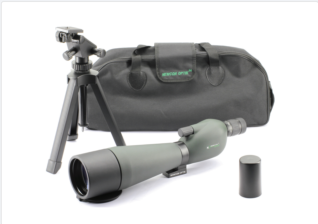
Standard Delivery Set