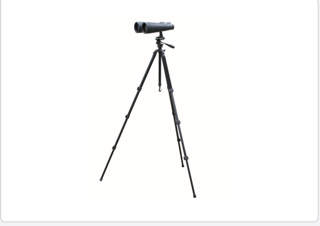
Mounted on tripod